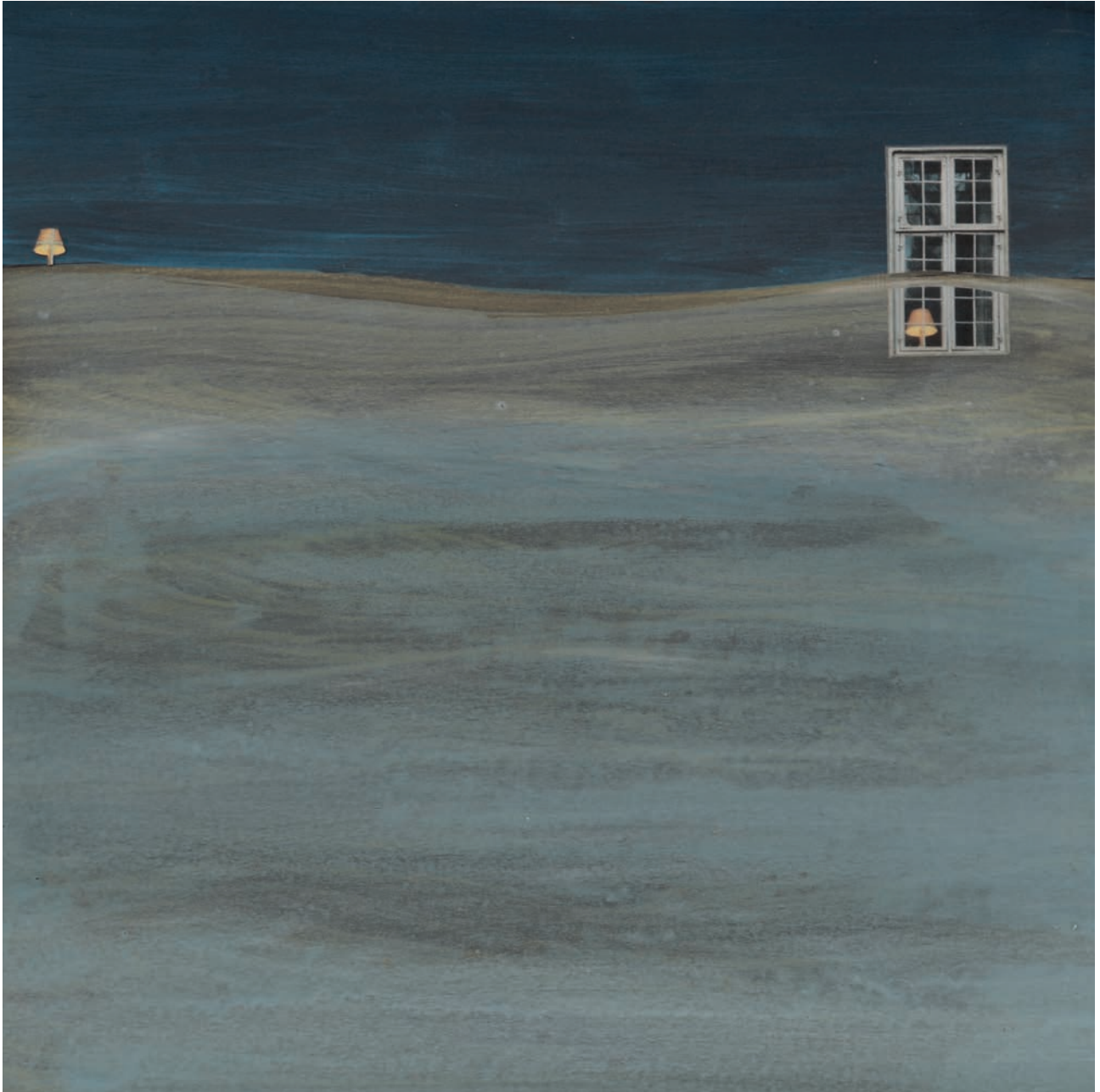
Dunes Story, 2018 Acrylic, photo & aquarell on wood, 30 x 30 cm