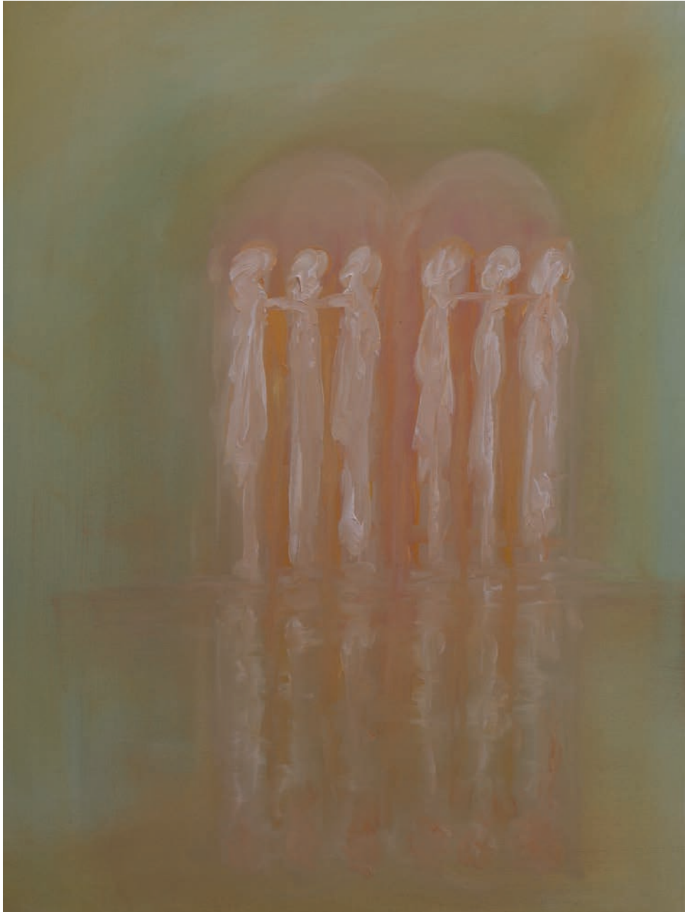
Common Intentions, 2019 Oil on canvas, 60 x 80 cm