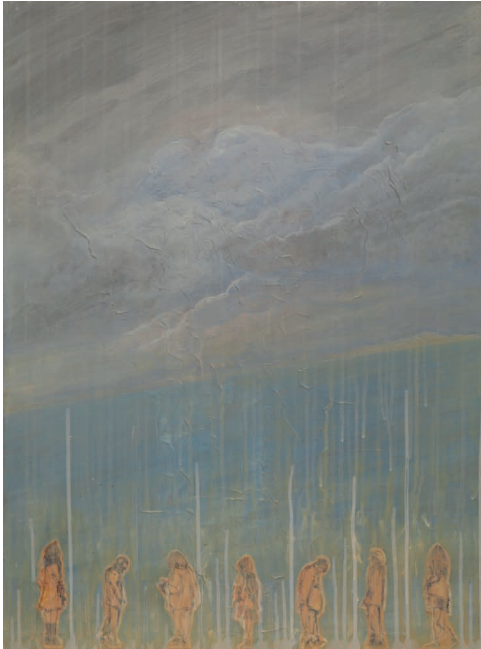
Awaiting Mood I, 2018 Acrylic, ink & aquarell on canvas, 60 x 80 cm