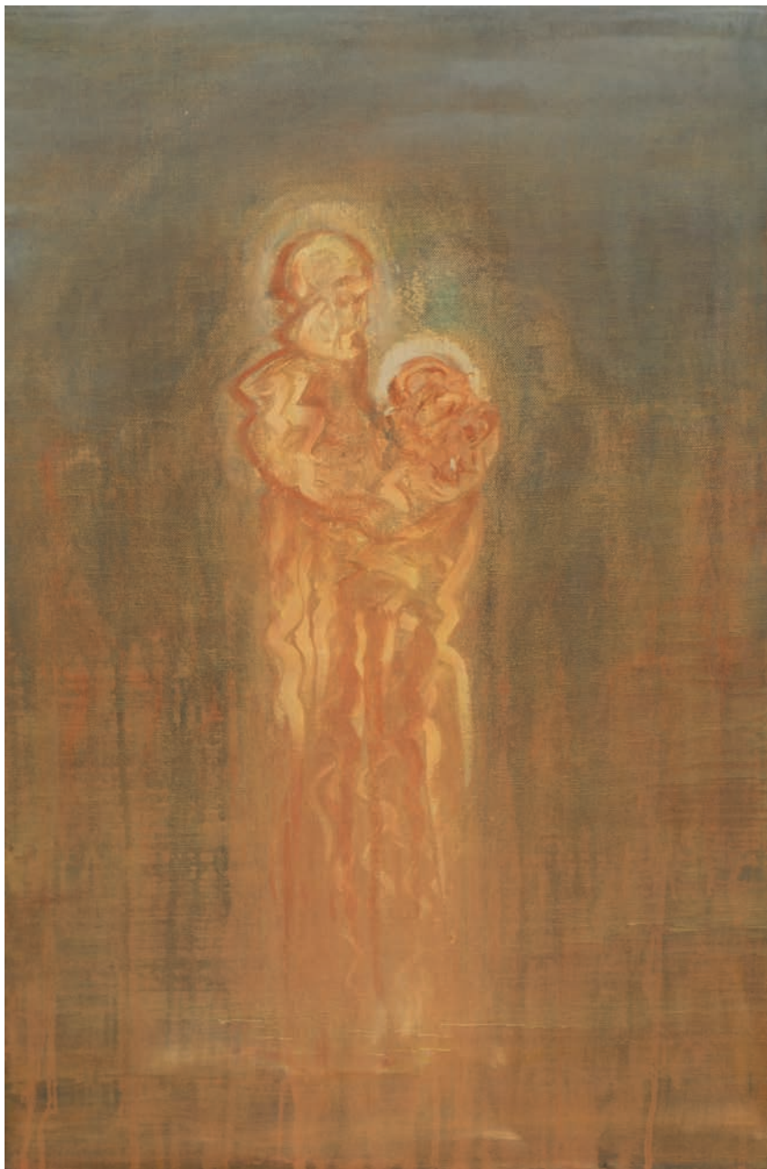
Holding, 2017 Acrylic & chalk on canvas, 45 x 70 cm