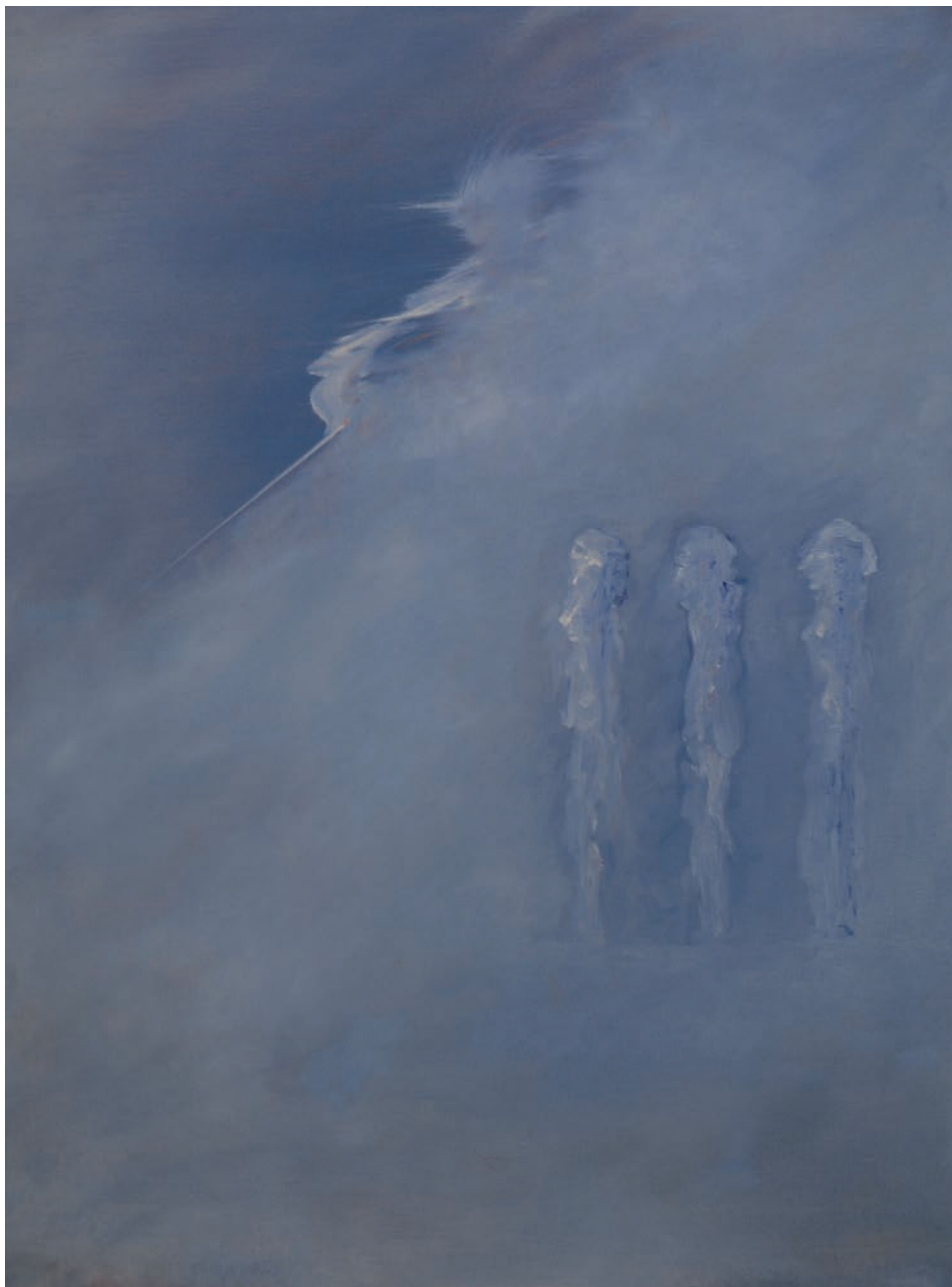
Waiting, 2019 Oil on canvas, 60 x 80 cm