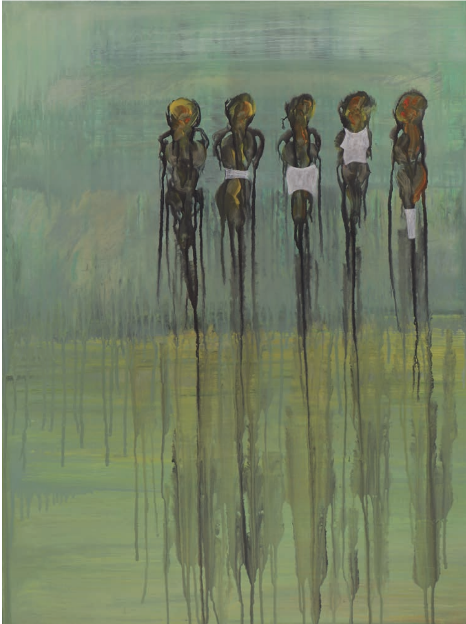
Muses After Swim, 2017 Acrylic & aquarell on canvas, 60 x 80 cm