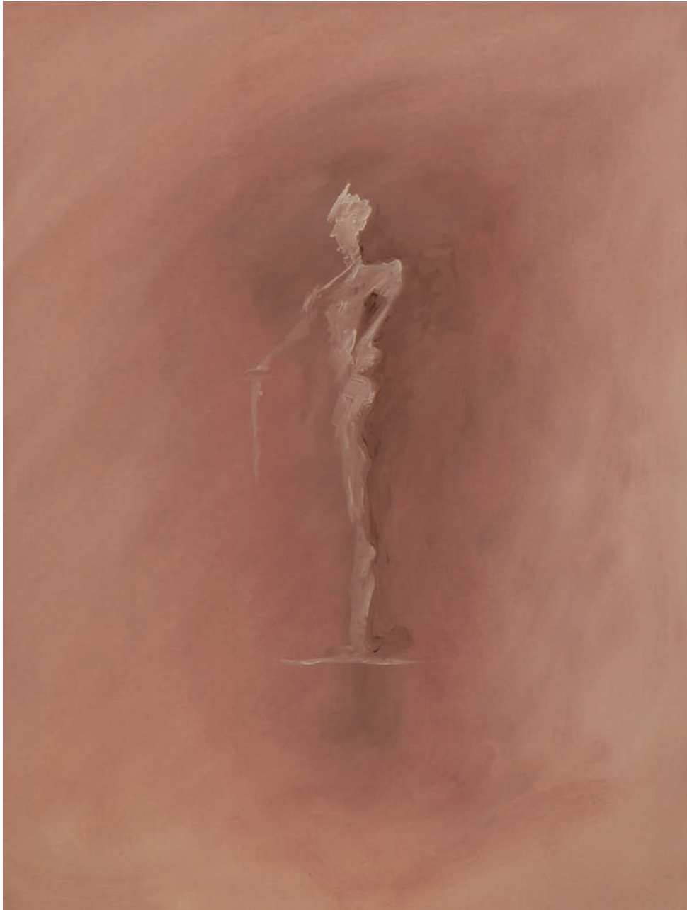
A. Giacometti Standing, 2019 Oil on canvas, 60 x 80 cm