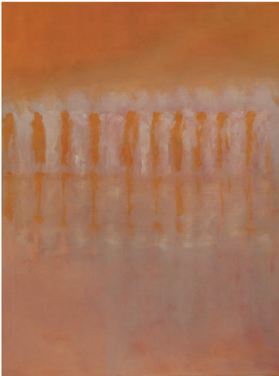
Inbetween Figures, 2019 Oil on canvas, 60 x 80 cm