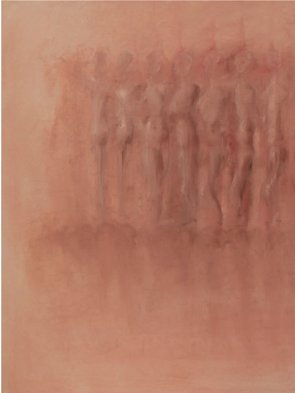
Simple Waiting, 2019 Oil on canvas, 60 x 80 cm