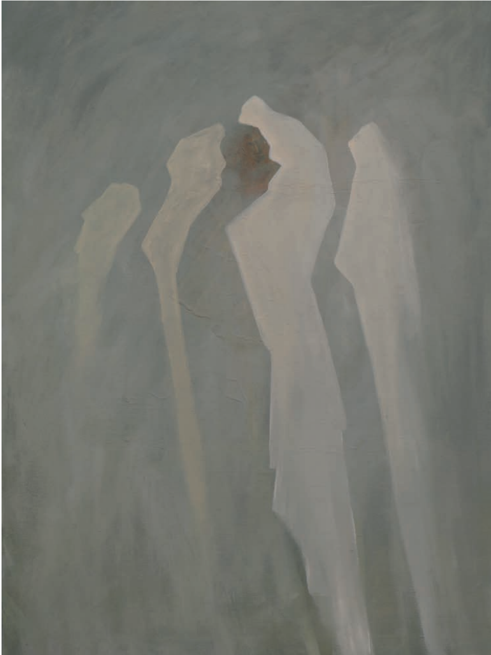
Appearances, 2018 Oil on canvas, 60 x 80 cm