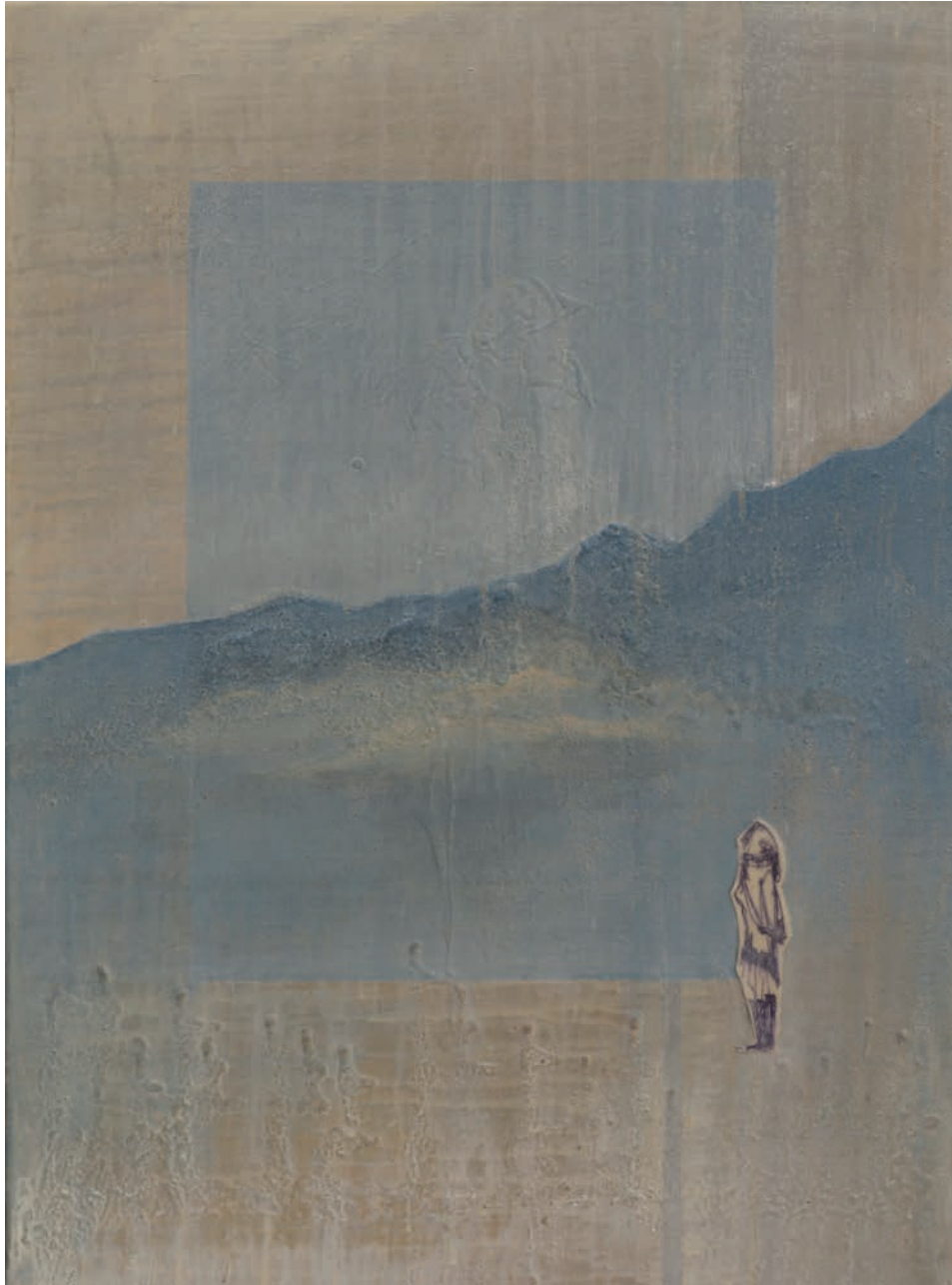
Awaiting Mood II, 2018 Acrylic, ink & aquarell on canvas, 60 x 80 cm