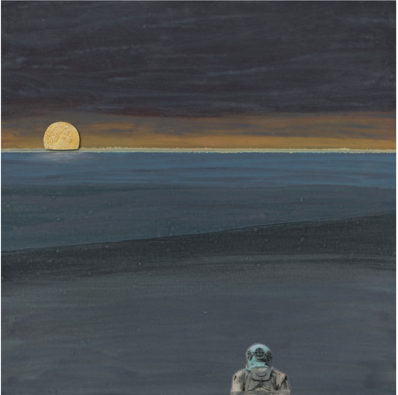
Treasure Hunt, 2018 Acrylic, plaster, photo & aquarell on wood, 30 x 30 cm