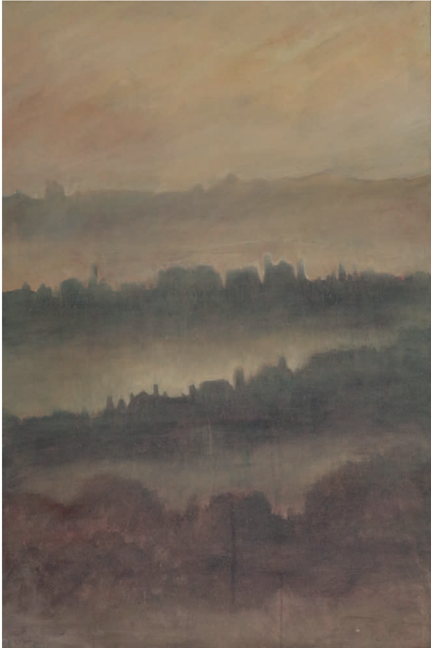
Illuminated Landscape, 2017 Acrylic & aquarell on canvas, 60 x 90 cm