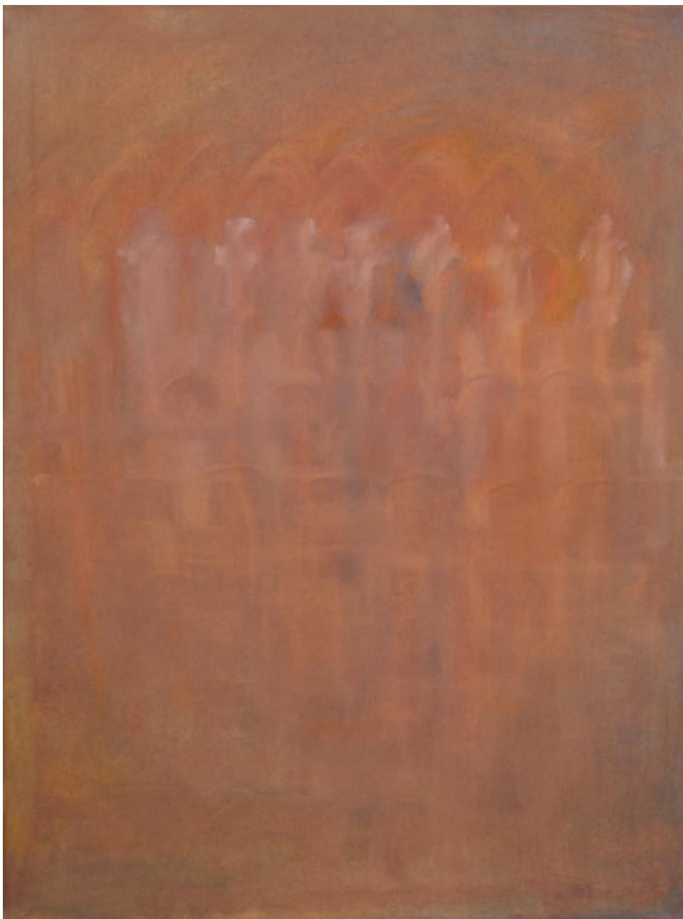
Figures on Faith, 2018 Oil on canvas, 60 x 90 cm