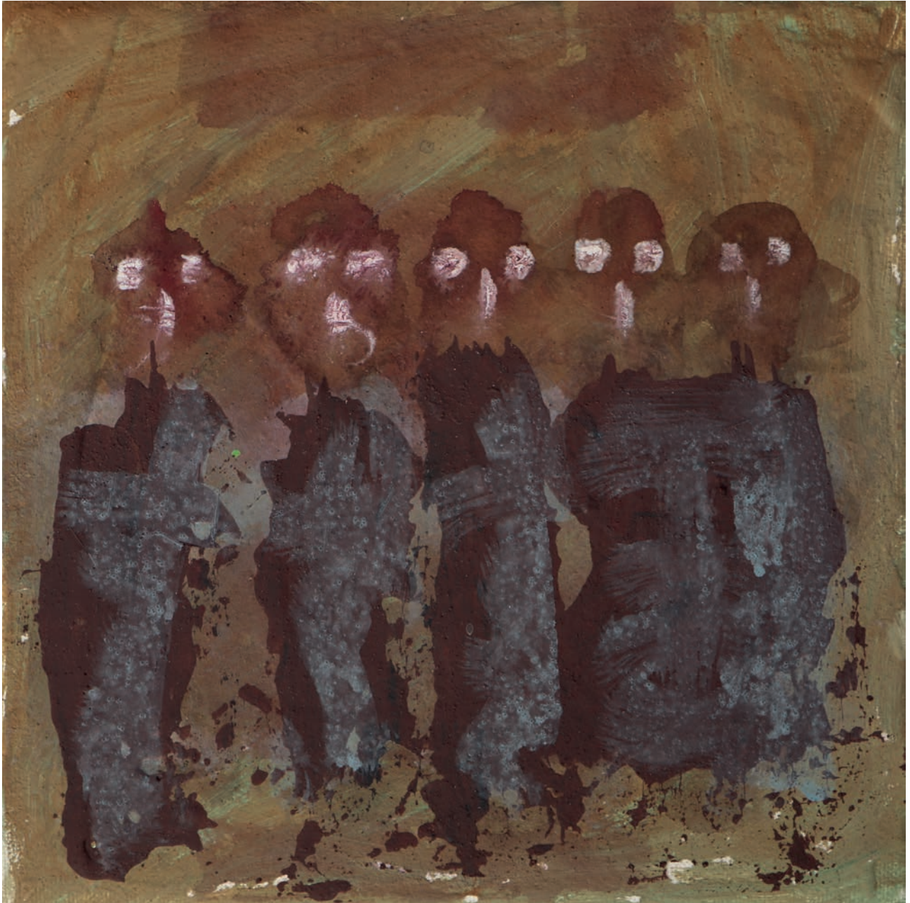
Silent Friendliness, 2018 Acrylic & oil on canvas, 20 x 20 cm