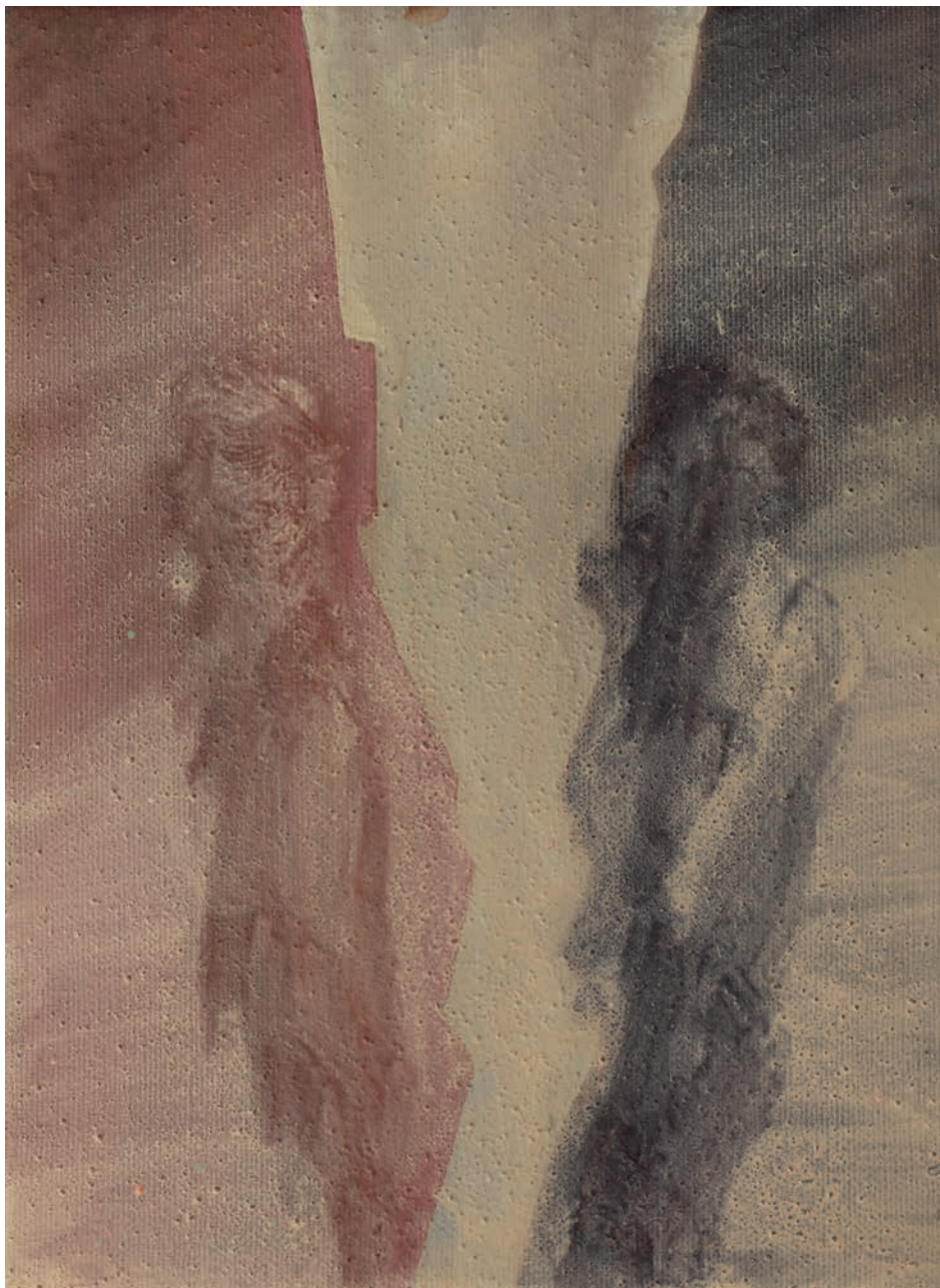
Togehter Apart, 2019 Acrylic & oil on canvas, 24 x 30 cm