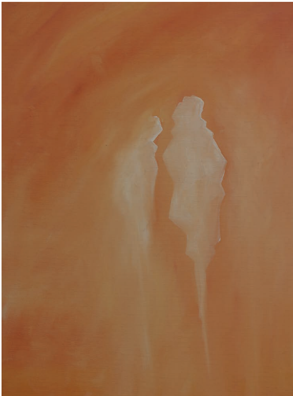
Emerging, 2019 Oil on canvas, 40 x 60 cm