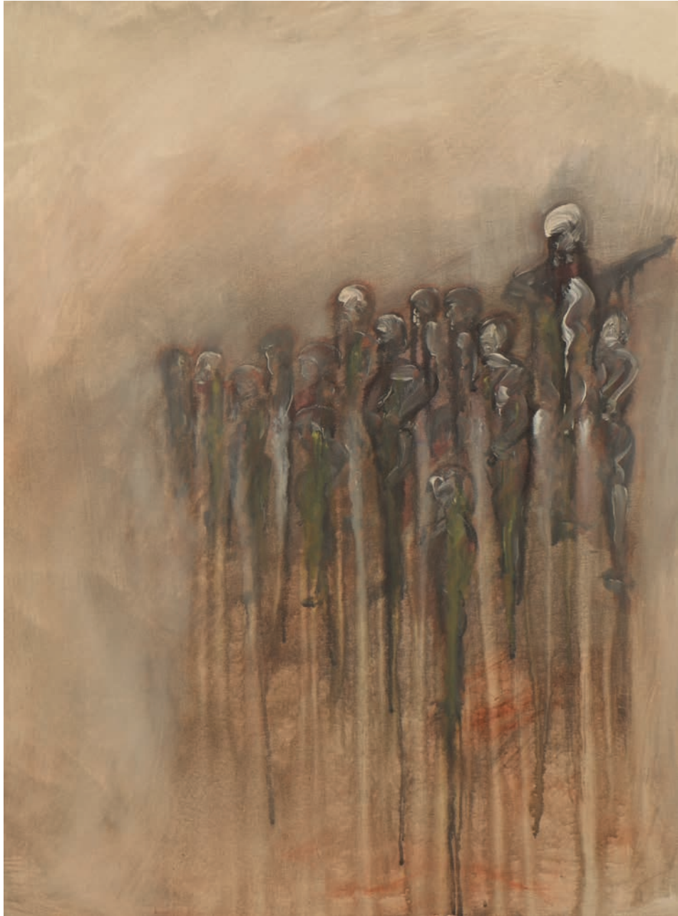
Listening Crowd, 2017 Acrylic & aquarell on canvas, 60 x 80 cm