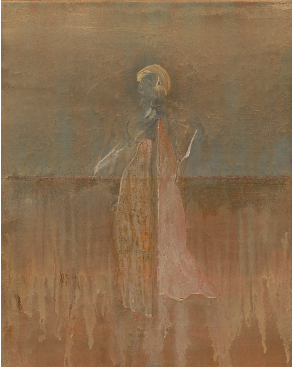
Figures in Sand, 2018 Acrylic on canvas, 45 x 60 cm