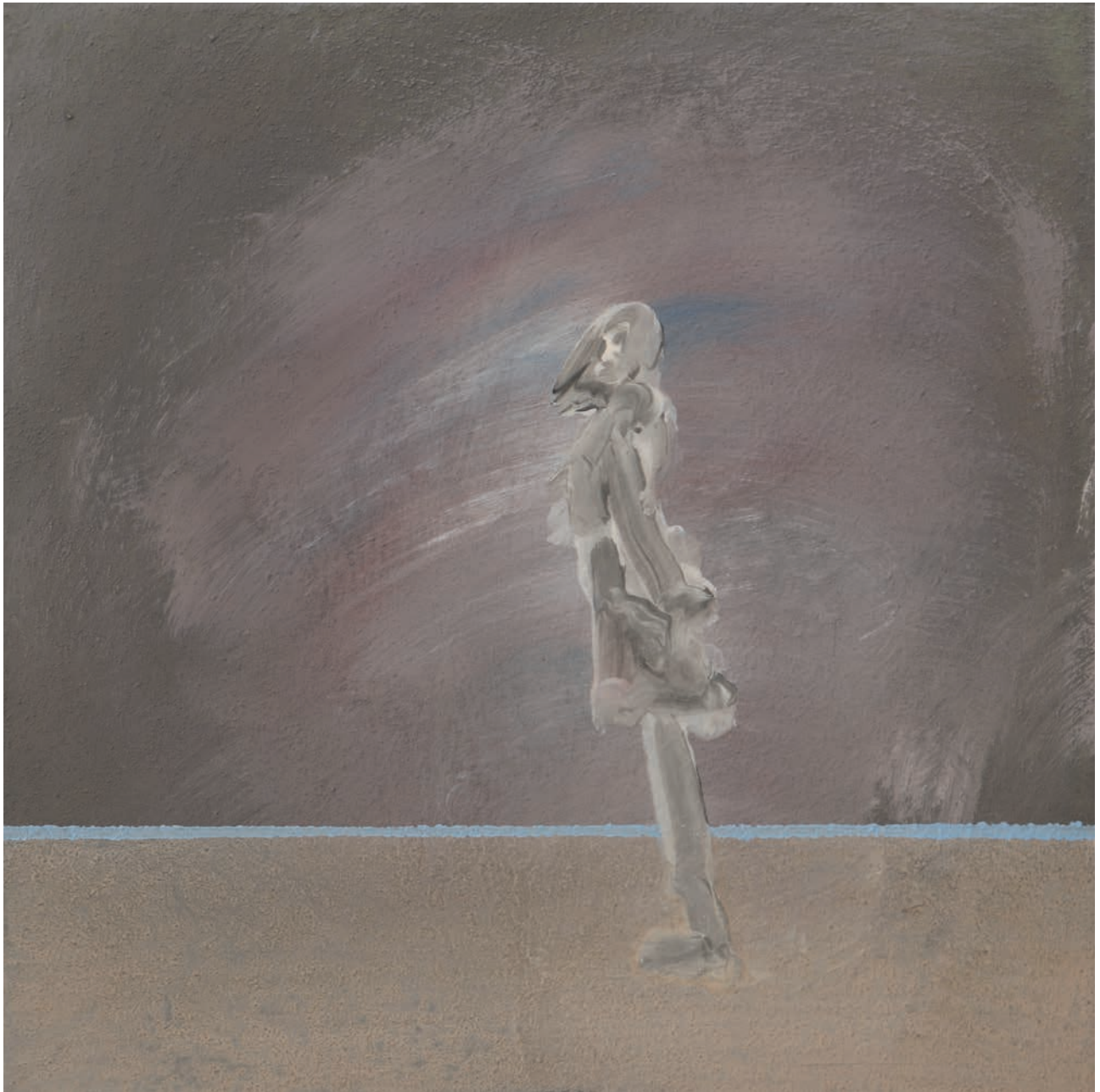
Planted in Sand, 2018 Acrylic & aquarell on canvas, 40 x 40 cm