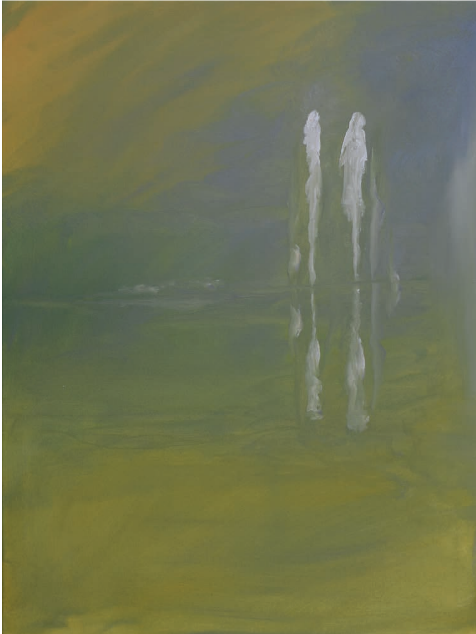
Abstraction Reflects, 2019 Oil on canvas, 60 x 80 cm