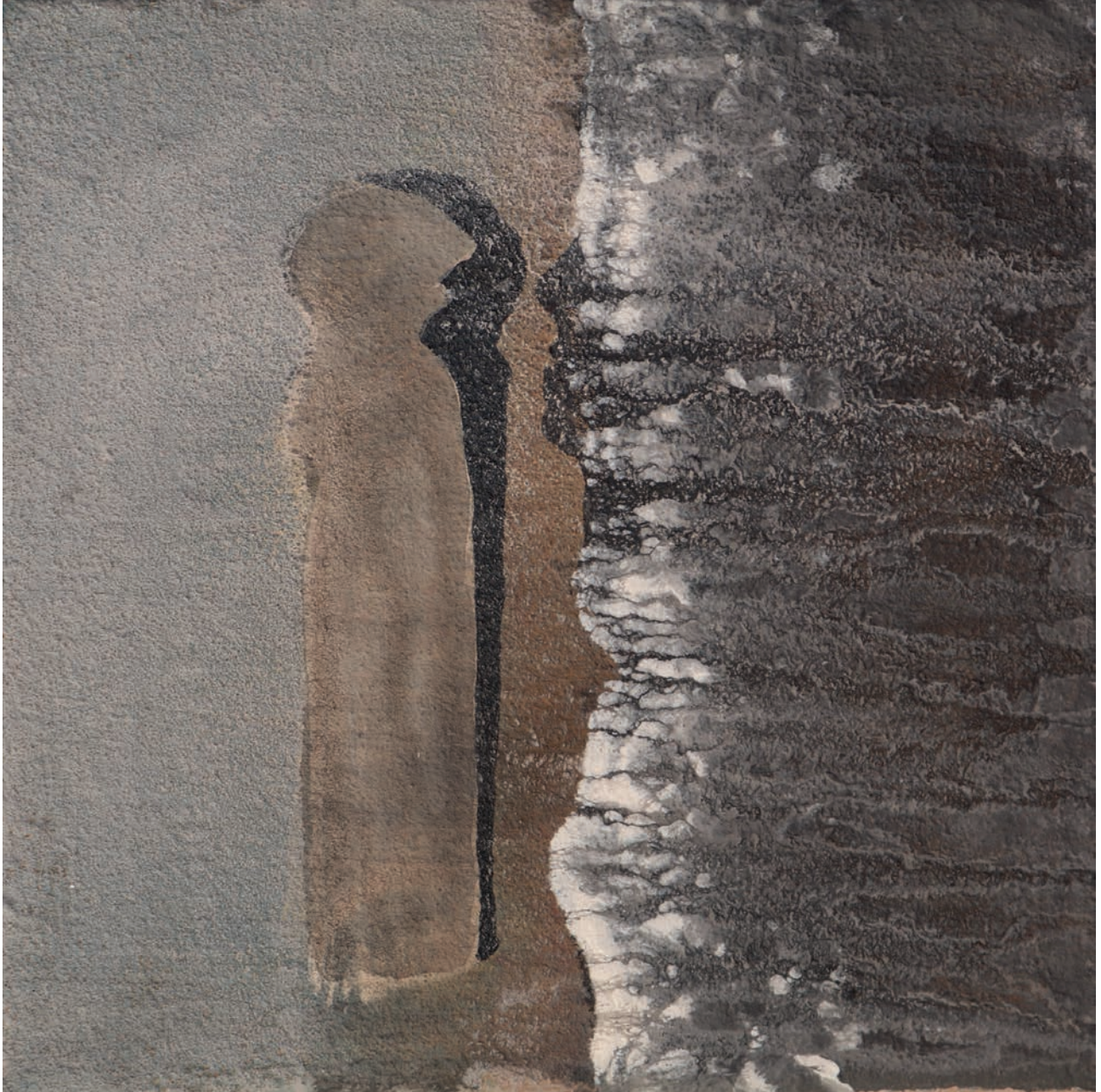
Waves, 2018 Acrylic & ink on canvas, 20 x 20 cm